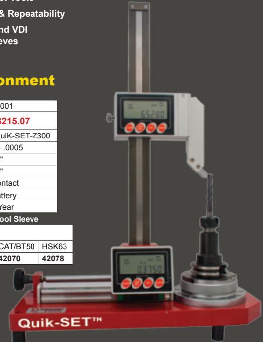
Heavy Duty Steel Base

FREE TEST BAR with the purchase of a presetter